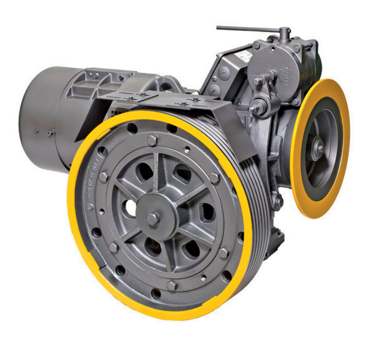
This modular hoisting unit solution is designed for quick installation when modernizing elevators in residential, small hotel and small office buildings.

The KONE MR12 and MR17 hoisting units are designed for modular modernization of elevators in residential, small hotel and small office buildings. These hoisting units have been designed to minimize installation time. The adapter bedplate enables replacement of most old hoisting units without engineering and welding on site. The adapter bedplate is added between the old bedplate and adjusted for the new hoisting unit.