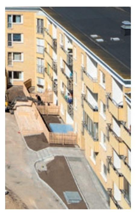
The residential building in Eskilstuna.