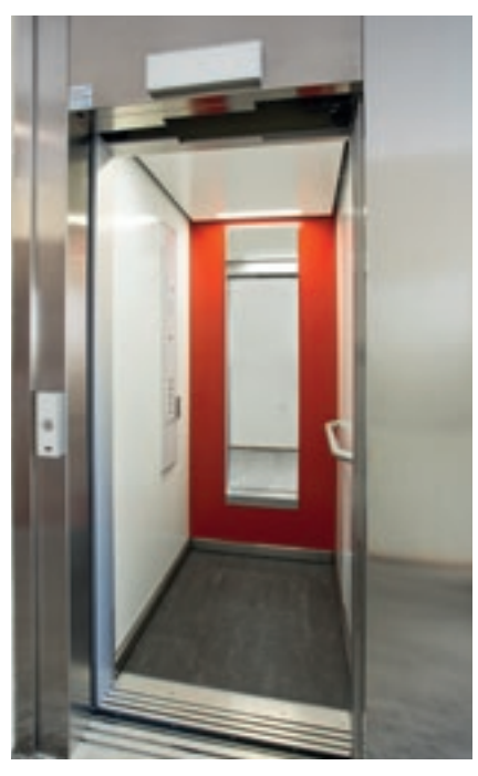
KONE MonoSpace® after modernization.