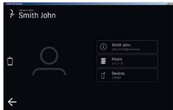
User information screen