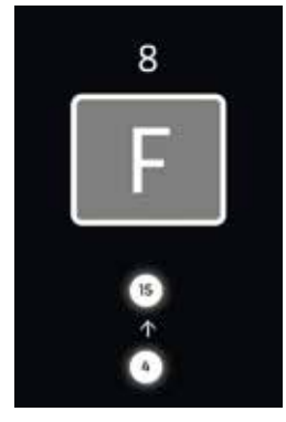
Allocated elevator is displayed