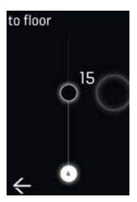
2. User indicates destination floor