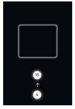
3. Elevator call is processed