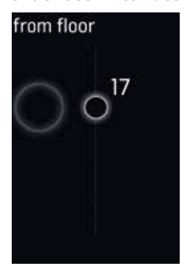
1. User indicates departure floor