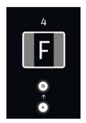
Arrival of the elevator is indicated