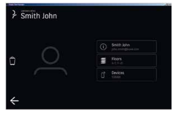
User information screen

For the latest product information and interactive design tools, visit www.kone.us